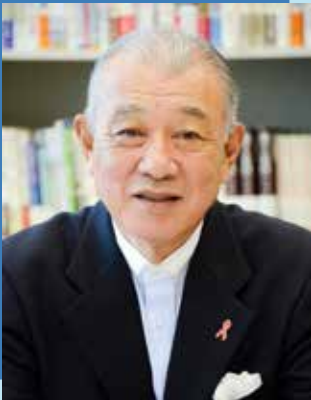
YOHEI SASAKAWA 2018