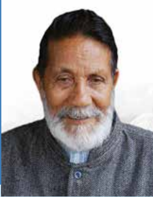
CHANDI PRASAD BHATT 2013