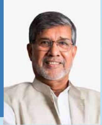
KAILASH SATYARTHI 2014